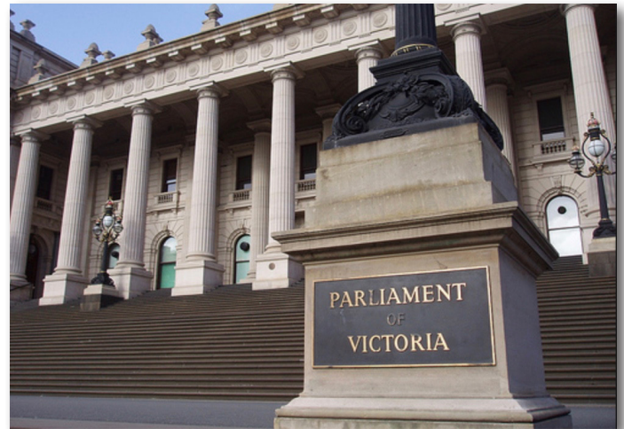
Victoria has become the first State following the Northern Territory to enact a right to die law - Voluntary Assisted Dying Act

Oxford University Press) who maintains that once you let doctors into the dying equation, you will never get rid of them, begging the question of whose interests are most at stake and why?