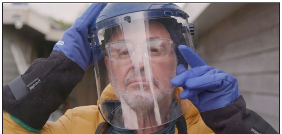
Vice: 'Time To Die' Documentary, London advance screening, 17 July 019