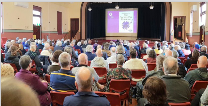
Melbourne Workshop, 3 August 2019

Please check the Exit website for this confirmation. Announcements will also be made in forthcoming Email Newsletters and, of course, in Deliverance.