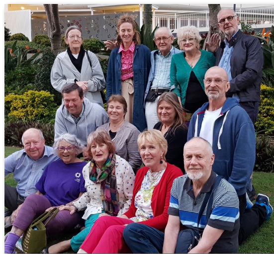
Exit Chapter Coordinators, Gold Coast, July 2019